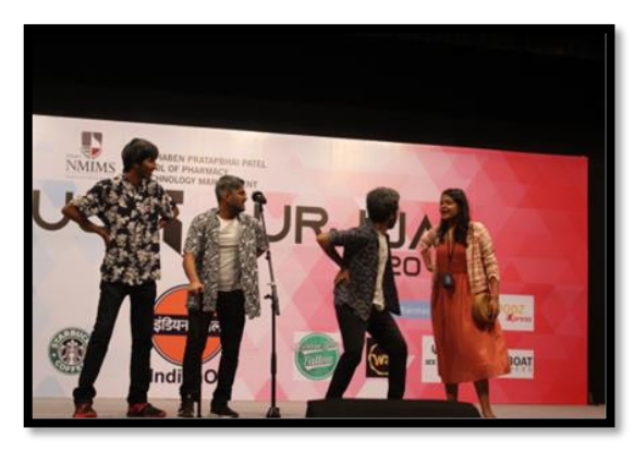
Performances by students