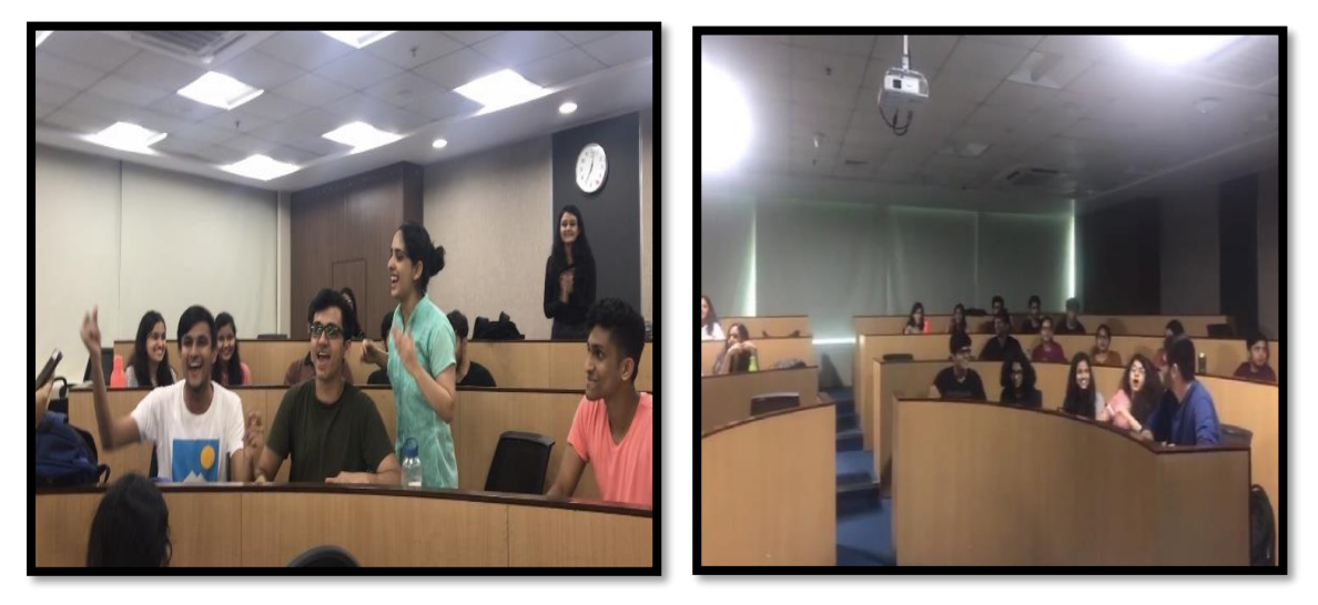
Students singing during the event