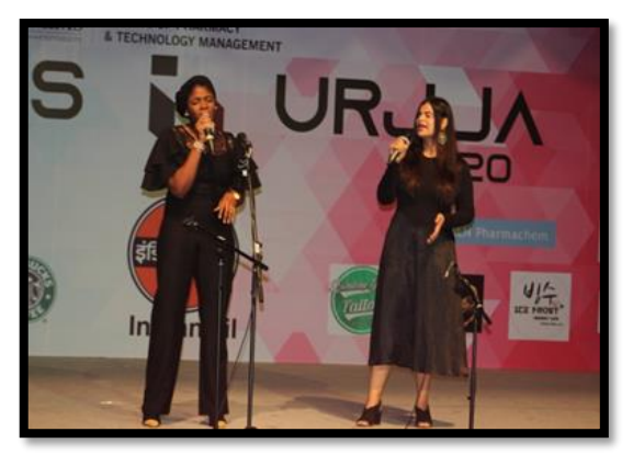
Performances by students