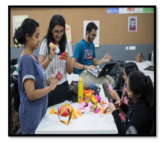
Students decorating the classrooms